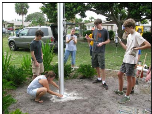
Scouts place the pole into the ground

SBUMC Troop 309 has been active in the community of Satellite Beach for over 45 years. We are an active Troop with a focus on developing leadership and outdoor skills within young men. We have a long tradition of service to the community, service to the church, and service to the district.