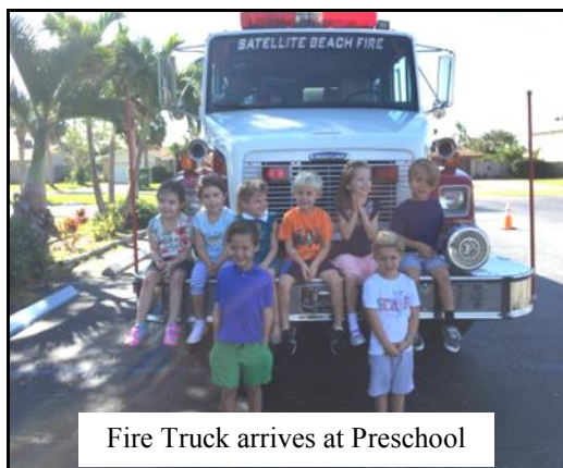
Fire Truck arrives at Preschool