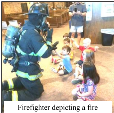
Firefighter depicting a fire