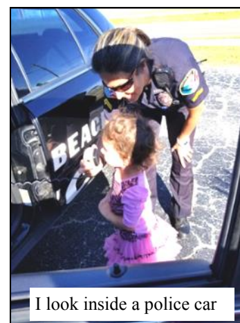
I look inside a police car