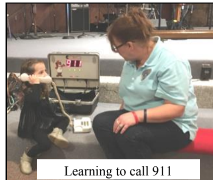
Learning to call 911