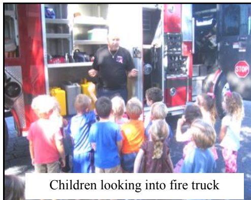
Children looking into fire truck