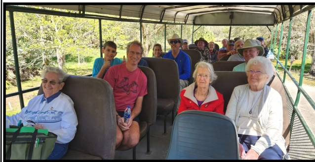
Forever Florida Field Trip Feb 24