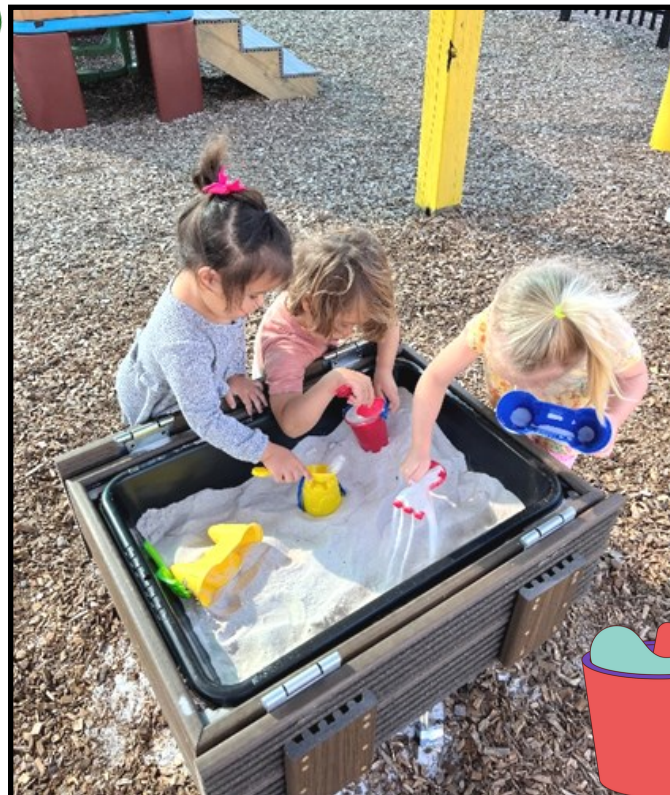
Sand play on the playground. →