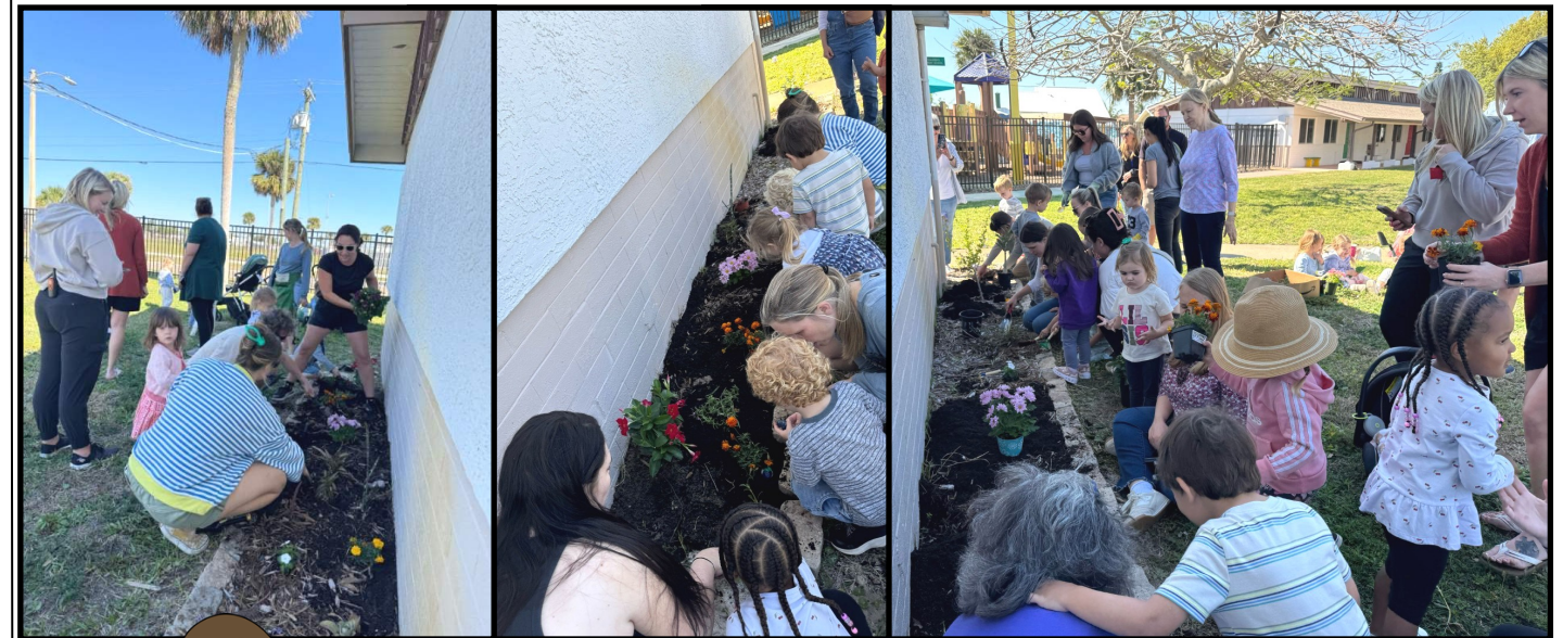
Three Year Olds & Parents Planting Flowers