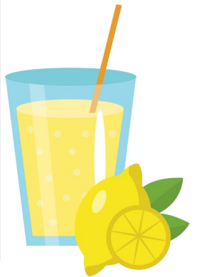
VPK Lemonade Stand